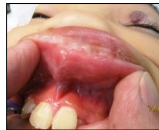
Figure 2. (upper left) 1 month after 1 st alcohol injection; (upper right) 1 month after 2 nd injection. The size was already decreased; (bottom) 2 months after 2 nd injection, a clinical improvement was achieved.

Afterward we performed excision of the lesion with compression on the left and right labial artery using Satinsky intestinal clamps during the surgery to control bleeding. The defect was closed with a mucosal flap preserving the orbicularis oris muscle. Tie-over dressing was applied to obtain compression effect to control bleeding after the intestinal clamps were removed.