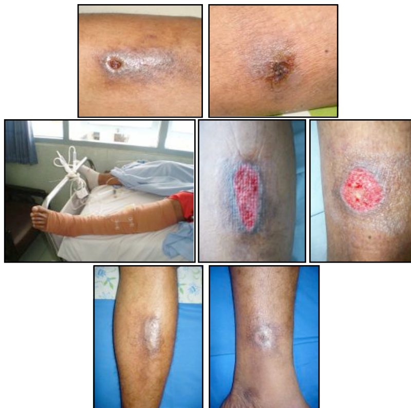
Figure 4. (Upper left and right) Male 28 year old with 4 months multiple chronic wound at the left lower leg region, There were two wounds that had necrotic tissue and surrounded by unhealthy skin, (Middle left) application of simplest modified vacuum-assisted closure (smVAC), (Middle right) 5 days after used the vacuum (the wound is ready to be closed), (Lower left and right) 4 weeks after treatment. the vacuum (the wound is ready to be closed), (Lower left and right) 4 weeks after treatment