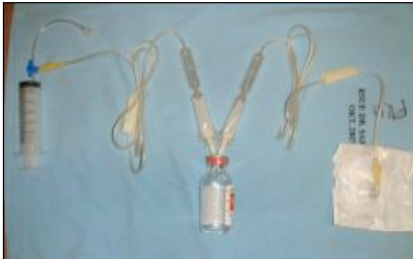
Figure 2. The simplest vacuum assisted closure (smVAC)