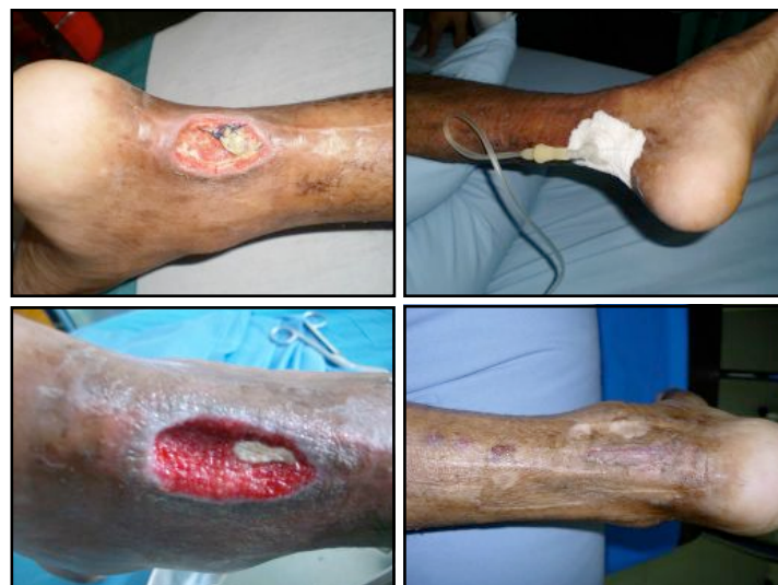
Figure 4. (Upper left) Male 24 year old with 4 months chronic wound at posterior side of the left ankle region, the wound is wet and there were sutures at Achilles tendon, (Upper right) application of smVAC, (Lower left) 12 days after smVAC (the wound is ready to close), (Lower right) 13 days after STSG + smVAC

granulation tissue and ready to be covered by graft. Then split thickness skin graft were performed and smVAC used again to assist the