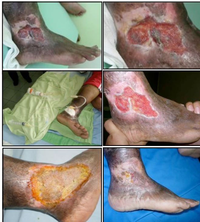
Figure 3. (Upper left) Male 52 year old with 25 years chronic wound at lateral side of the right ankle region, (Upper right) The wound has bad granulation and necrotic tissue, (Middle left) application of simplest modified vacuum-assisted closure(smVAC), (Middle right) 7 days after smVAC (the wound is ready to be closed), (Lower left) 5 days after STSG + smVAC, (Lower right) 10 days after STSG + smVAC